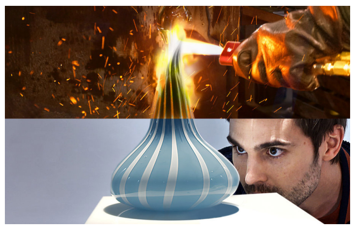
In Blown Away ten master glassblowers compete for $60.000 prize money and a residency at the Corning Museum of Glass.

Blown Away, the first-ever TV competition series featuring the art of glassblowing, premiered worldwide on Netflix on July 12, 2019. The show follows a group of 10 highly skilled glassmakers from North America who fabricate beautiful works of art that are assessed by a panel of expert judges. The winner received the new Blown Away Residency at the Corning Museum of Glass. An exhibition telling the story of the Museum's involvement in the creation of the series is on view until July 1, 2020. It includes a behind-the-scenes documentary with interviews conducted on the set and footage captured of the Museum's Hot Glass Demo Team taking part in the finale and one final product from each competitor. Additional videos can be found on the Museum's YouTube page. Casting for a second season of Blown Away was announced in November.