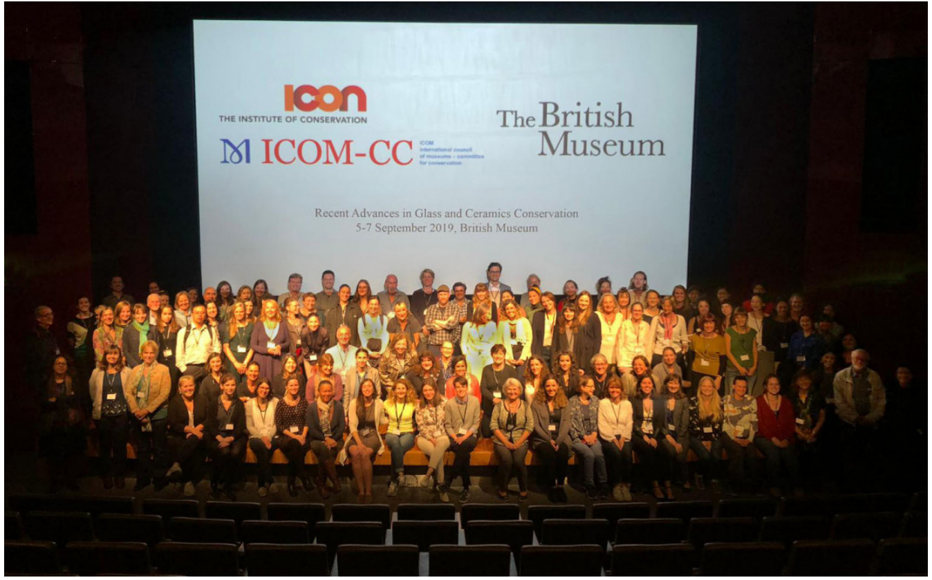
Group photo of all the delegates who attended the conference Recent Advances in Glass and Ceramics Conservation.

The second day of talks started with session 4, which was filled with impressive presentations on different treatment methods. The use of acrylic barrier surfaces for epoxy resins was discussed (Thea Schuck) and a comprehensive overview of the aging and identification of different polymer fills was presented by Norman Tennent. The use of PVC foil molds for the production of large epoxy resin fills was shown by Rebecca Gridley, and Roy van der Wielen showed the protocol he developed for the solvent-free production of Paraloid casts for flat glass. The student talks in session 5 considered a wide variety of topics including the use of 3D technology for restoration of ceramics (Lien Acke, Erato Kartaki), the investigation of treatment methods (Emily Thomas), technical studies (Cassia Balogh,