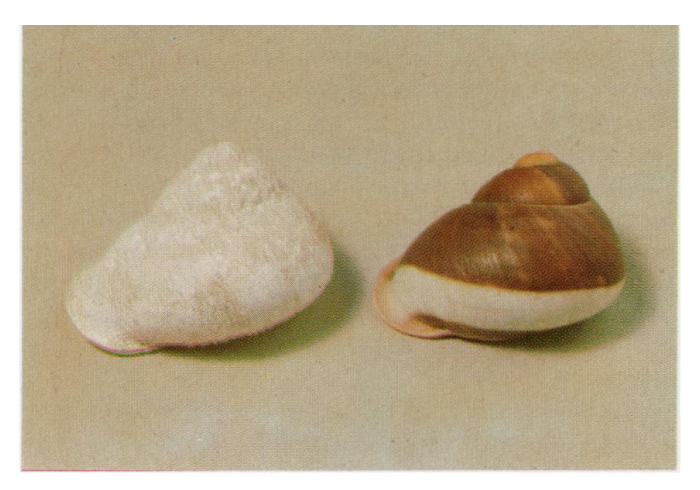
Two shells from the same storage drawer, one showing a complete covering of efflorescence.

This compound, Tennent's salt, was first described by Norman H. Tennent 1985 on mollusks. The British museum lab also found cases on ceramics and marble. Powder diffraction data now allow the quantification of this compound in mixtures. Raman and FTIR spectra are reported for reference. Next structure to be determined: calcium acetate hemihydrate which