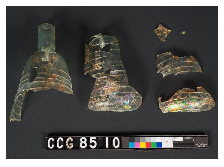
Searching for optimal storage conditions for archaeological glass in the study collection of the Conservation Center of the Institute of Fine Arts, New York University.

The survey can be found online by following this link. Please respond before January 20, 2020.