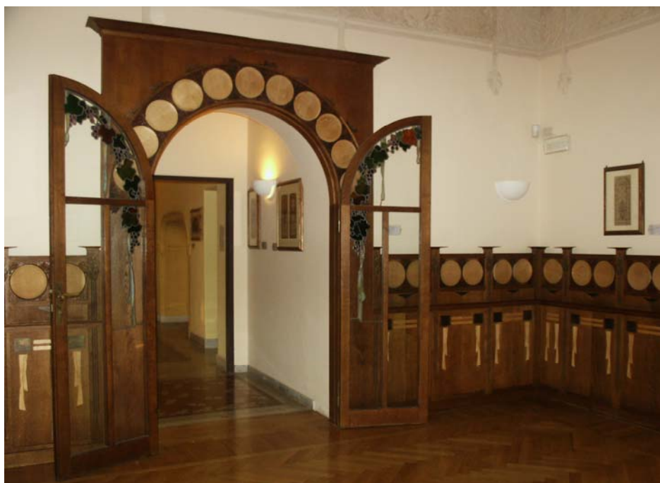
Figure 7: Dining Room after restoration and the reapplication of the panelling

Three rooms on the ground floor of the House of Owls were richly decorated with wood panelling. These at the start of the project were in an awful state of preservation. The precious carved wood was scattered on the ground, in part burned by fire, in part reduced to irrecoverable fragments. The choice regarding what type of intervention should be undertaken was not easy. This was only made after a careful survey revealed what could be recovered and a further research of the archives was completed. It was decided to restore and complete as much as possible of the panelling in the dining room as it was less damaged (Figure 7), but to leave panelling in other rooms in a more fragmentary state. Some surviving fragments from the other two rooms were also restored, bearing witness to the original fixtures but without proposing a reconstruction that would have inevitably been arbitrary.