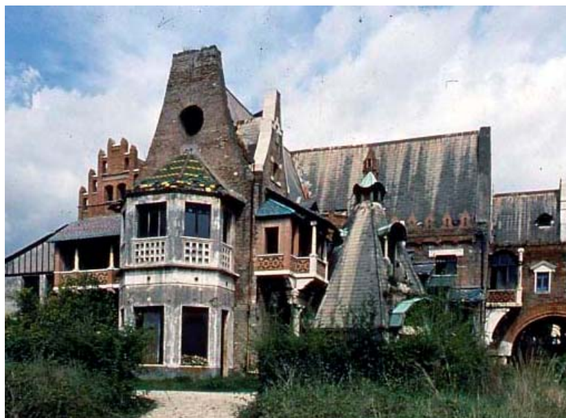
Figure 2: The House of Owls before restoration

The conservation of the House of Owls was long and complex, due to the peculiarity of the building that presented an incredible fusion of architecture and decorative arts and the richness of the fixtures therein. The presence of these different materials required specific criteria and methods of treatment and intervention.