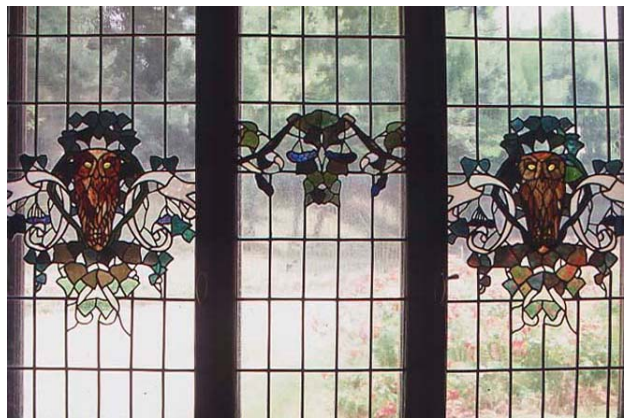
Figure 6: Diulio Cambellotti, Window with Owl after restoration