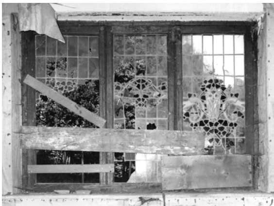
Figure 5: Diulio Cambellotti, Window with Owl before restoration

The total loss of some of the stained glass panels posed the choice whether to leave a gap or integrate a reconstruction of the missing panel, at least in the instances where the original cartoons of the designs were available or panels were part of a repeating pattern or series. After a thorough evaluation, it was decided to recover as much of the building's decorative richness as possible, either by using original cartoons to reconstruct missing elements or reproducing copies based on the design of an existing original. For instance, the four rhomboid glass panels with migratory birds and those the representation of the seasons, both sets designed by Diulio Cambellotti, were recreated using cartoons, while the ovals with climbing vines and grapes, also by Cambellotti, were reconstructed based on existing originals. The date and hallmark of the firm Giuliani were included along the border in order to identify the new stained glass panels. When, on the contrary, no information existed about missing stained glass panels, the decision was made to leave a gap in the decorative scheme, installing instead a simple transparent glass panel constructed with rectangular panes held together with lead comes.