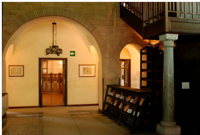
Figure 8: A room with a museum display

This museum project was realized thanks to the discovery, by the firm Vetrare d'Arte Giuliani, of the archive of Cesare Picchiarini, the master glassmaker who crafted all the glass in the House of Owls and who re-launched the fashion of stained glass by holding successful exhibitions. The acquisition by the Municipality of Rome of the whole collection, consisting of designs, sketches, and cartoons, but also other pieces of stained glass, has resulted in a unique museum of its kind. The additional designs and glass works have been used to decorate the rooms of the House of Owls in a continued cross-reference with the glass in the windows and doors, ultimately enriching the building. The building, originally conceived for private residential use, now offers a journey of great interest between architecture and decorative arts (Figure 8).