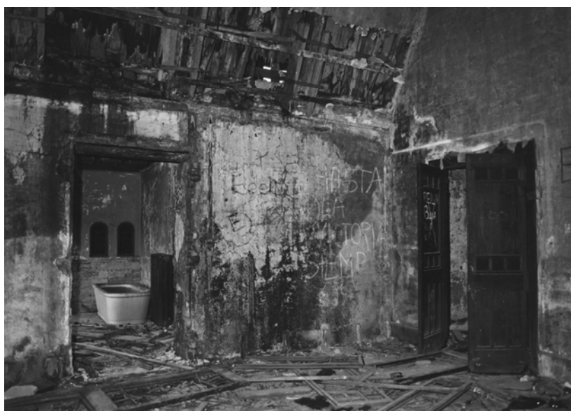
Figure 3: The Prince's Bedroom and the Bathroom before restoration

The situation in 1993 was disastrous. The conservation of all elements needed to be carried out contemporaneously: recovering architecture structures and making them functional while at the same time reconstructing the incomplete decorative elements. This meant restoring the surviving decorative elements that remained amidst problematic gaps or even at times the total loss of entire sections. The aim was to return a certain legibility to the complex as a whole, recapturing the original harmony between the architecture and the decorative arts therein, to show again the image of that incredible and original residence that Prince Giovanni Torlonia had created. However, it was necessary to avoid arbitrary interventions, not based on documentary evidence and, obviously, to respect and preserve, in the best possible fashion, that which had survived. The rooms of the House of Owls were completely devastated and cluttered with all types of detritus (Figure 3).