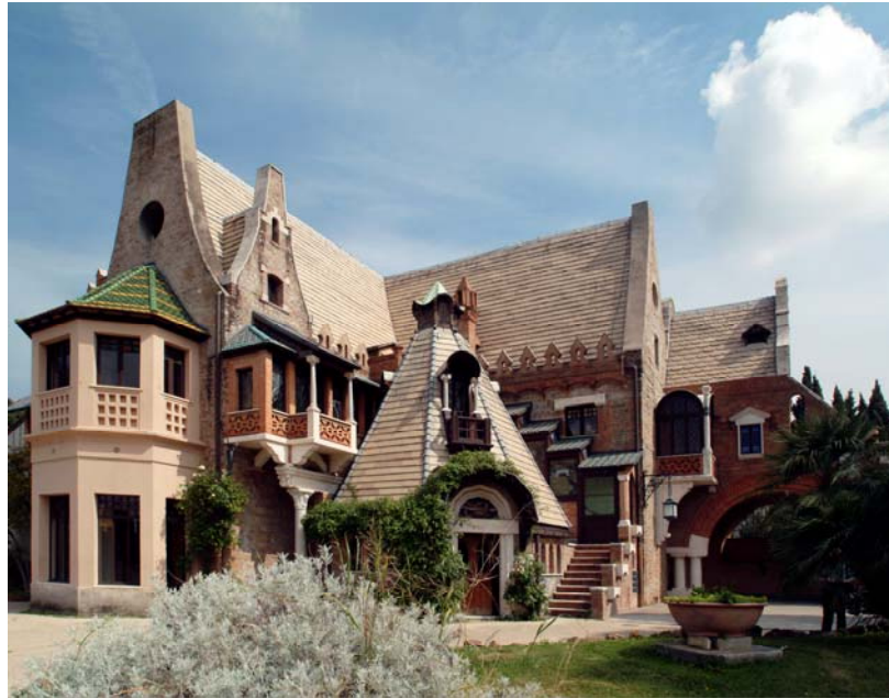
Figure 1: The House of Owls today

Among these buildings the most peculiar is Casina delle Civette , or “House of Owls”, so-called because of the rich architectural decoration of images of the nocturnal animal that are represented throughout [2]. The origin of the house dates to 1840, when the Venetian architect Giuseppe Jappelli designed for Prince Alessandro Torlonia a rustic farmhouse, initially named the Swiss Hut, constructed to decorate a section of the park in the fashion of English gardens. Several renovations and refurbishments that took place between 1909 and 1930 completely changed the structure of the building, transforming the rustic hut into an elegant and eclectic cottage, with interiors richly adorned and furnished, resplendent in color (Figure 1).